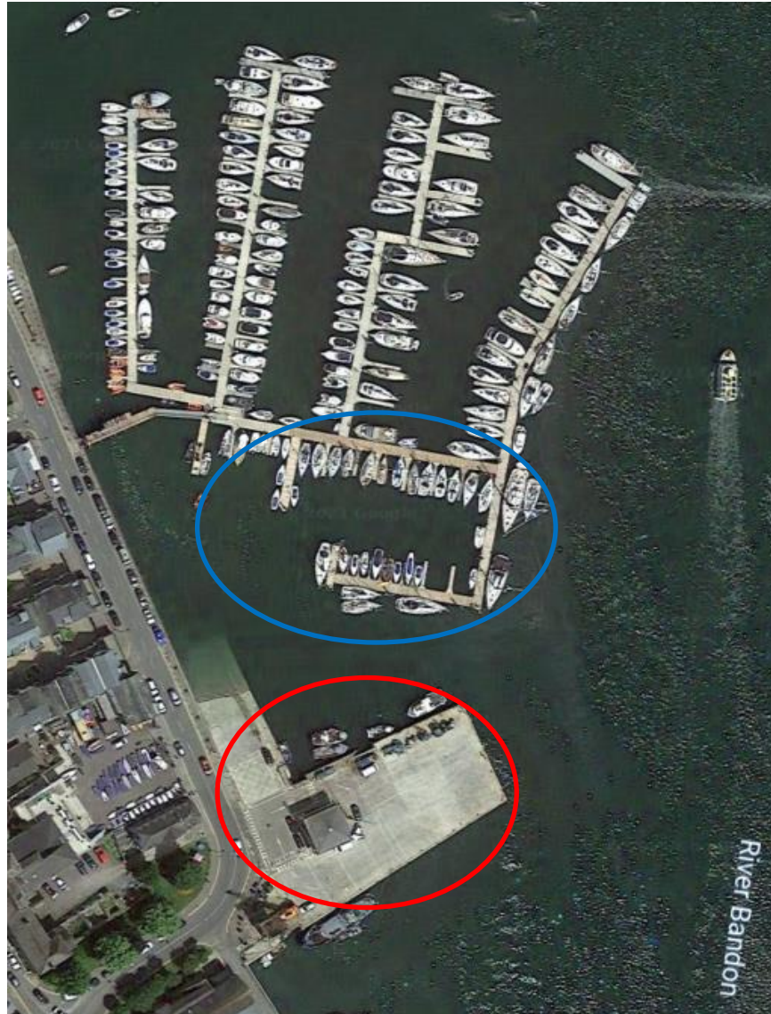
Figure 1- Kinsale Pier- Craning in/out Location and Berthing